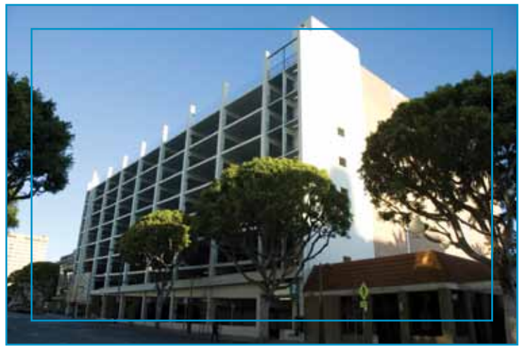
Santa Monica Parking Structure #2.

The upper four floors, added at a later date without the use of shrinkage-compensating concrete, contain some widely distributed random cracks, most of them visible on the top level. Of particular interest is a very noticeable crack running in the north-south direction on the top (9 th ) level at the north end of the building, in the exterior slab span along the grid line separating the west and center aisles. This crack is about 15 feet long, visible at the top and bottom of the slab, measuring \frac{1}{16} inch wide at the top and hairline at the bottom. A similar crack is visible in the asymmetrical location near the southeast corner, but smaller with a measured width of \frac{1}{32} inch at the top of the slab. I did not observe this crack at the same location on any other floor. The crack at the top level may have been aggravated by temperature effects since it is fully exposed to the environment, but the presence of this crack on a floor built with conventional concrete, and its absence on lower floors built with shrinkage-compensating concrete with more severe RTS conditions, suggests that shrinkage-compensating concrete made the difference.