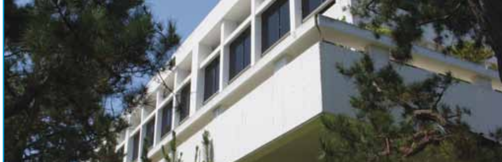
Building M5, southeast corner showing dramatic cantilevered post-tensioned beams at Plaza Level.

pan joists in R6 for extra stiffness) spanning between beams located on and midway between column lines. The intermediate beam was supported by a girder spanning between columns. Seismic framing for both buildings was provided by moment-resistant beam-column frames in both directions.